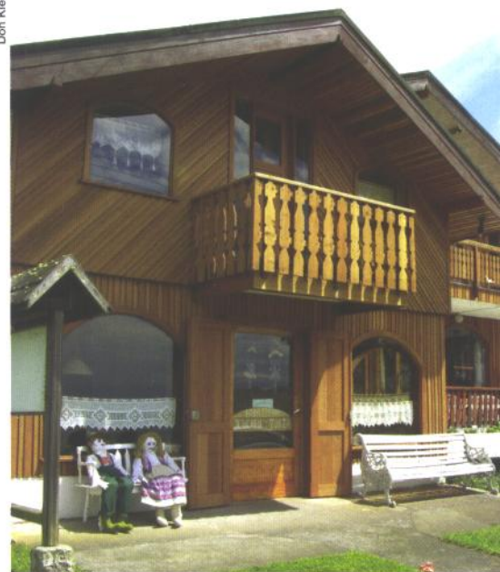
A hotel in Frutillar shows the distinct Tyrolean architecture.