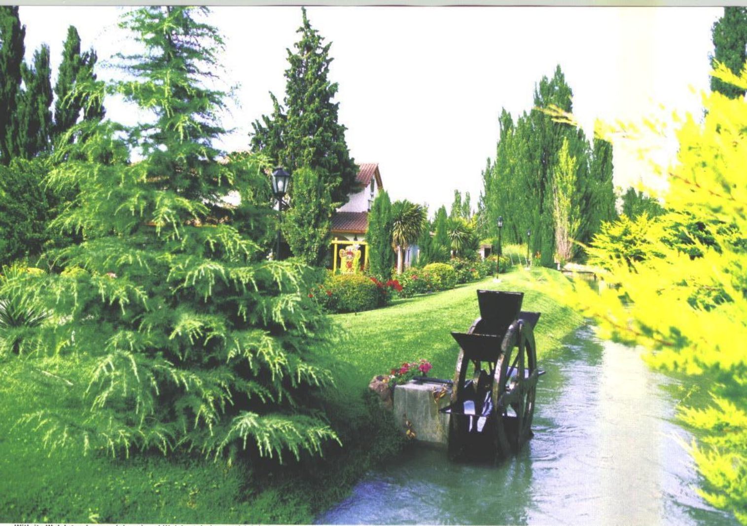
With its Welsh tea houses (above) and Welsh-style homes (right), Argentina's Chubut region is home to the largest population of Welsh speakers outside of Wales.